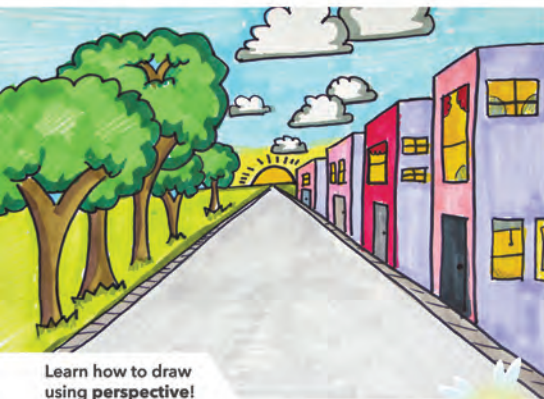
Learn how to draw using perspective!