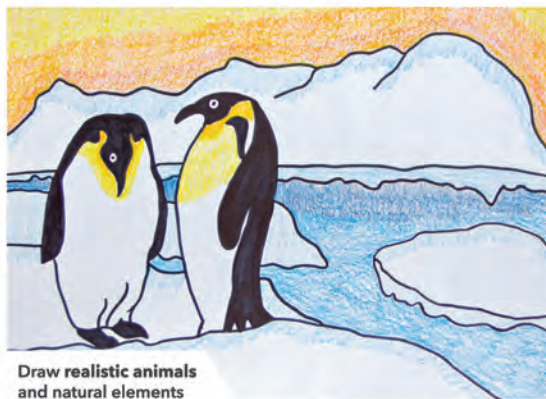
Draw realistic animals and natural elements